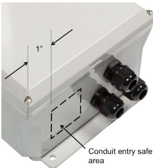
Conduit entry safe area